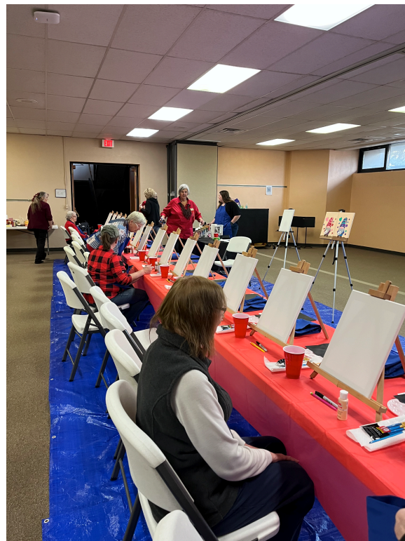
All set up and ready to paint