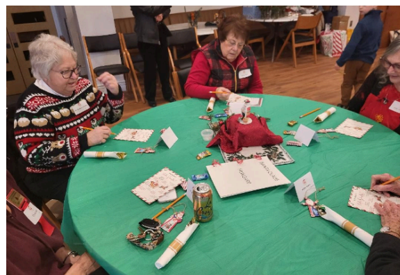
Santas Around the World with Delta Chapter

We ended the year with one of our favorite social events. Our Christmas get-together with our sister chapter, Delta. Alpha Rho hosted with the theme of "Santas Around the World". We had decorations, games, and food centered around our theme.