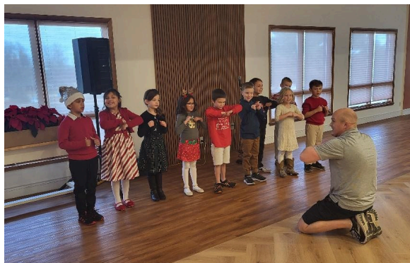
First Graders from Frontier Charter Academy